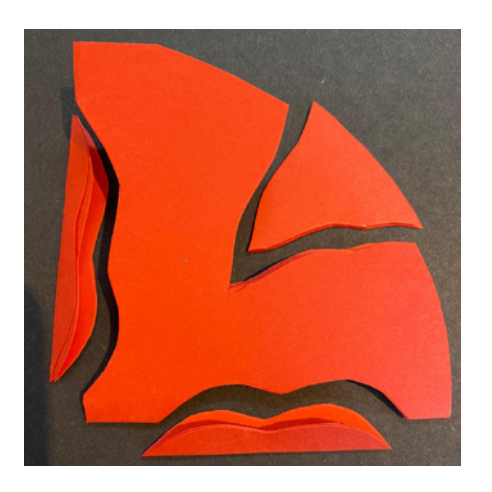
3b. If you are using a paper knife: draw shapes in the circle – they can be geometric, they can be animal shapes or plants and flowers, any shapes that you like – important: keep them simple: you now have to cut them out!