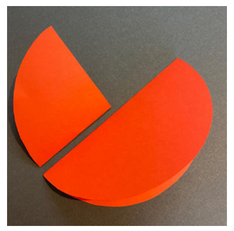
3a. If you are using scissors: fold the circle in half and then into quarters and cut various shapes along the folded edges (similar to cutting snowflakes).